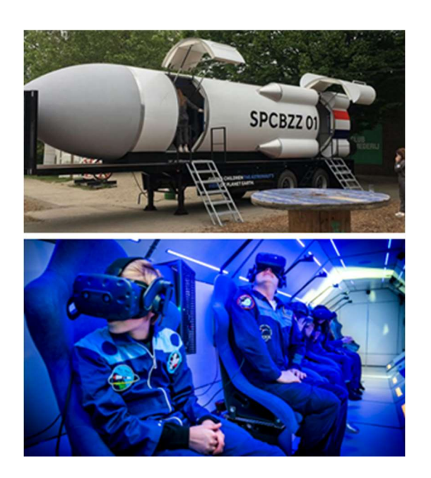
Figure 2: VR hardware

In the review by Mikropoulos and Natsis (2011), gender could have an effect on performance in VR scenarios. Learning gains in VR experiments for girls and boys have been reported to differ using VR (Mackinnon, Bacon, & Osunde, 2018). Age has been added because older children might have more prior knowledge on the subject than younger children (Borgers, de leeuw, & Hox, 2000), and prior knowledge influences the effectiveness of a learning environment (Otero, 2001).