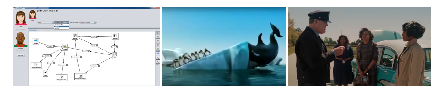
Figure 1: Screenshots of activities in our usability study. Left: A one-hour module on forest ecosystems from the Betty's Brain science education technology (Leelawong & Biswas, 2008). Center and right: TV/movie clips from our social-reasoning QA activity, including animated (e.g., Cooperation short film) and live-action (e.g., Hidden Figures ) clips; Table 2 lists all clips.

Here, we study usability and engagement as part of a formative, user-centered design process in a larger project that aims to translate the Betty's Brain science education system (Leelawong & Biswas, 2008), designed and used to date for typically developing middle school students in general classroom environments, into a new intervention for teaching the-